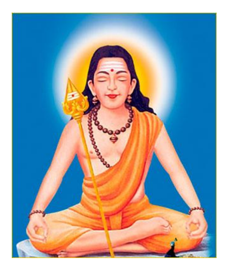
The Tantra of the 18 Siddhas by Nityananda

A practical and short definition of Tantra is: the effort of concentrating in the higher chakras , in the top of the head, the vital energy that is accumulated in the lower chakras . By doing so, it is this energy by itself that activates the most elevated states of consciousness, associated with the higher chakras .