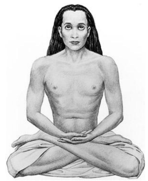
Babaji as appears in the book "Autobiography of a Yoqi"